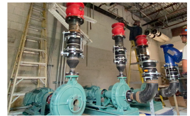
Pizzo K-8 School $3.5 Million - A/C Overhaul, Elevator, Fire Alarm System & Generator