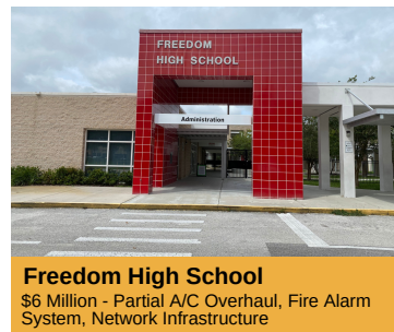
Freedom High School $6 Million - Partial A/C Overhaul, Fire Alarm System, Network Infrastructure

14 MAJOR SUMMER 2021 PROJECTS COMPLETED $73 MILLION INVESTED INTO THESE PROJECTS