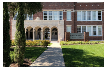
Franklin Boys Preparatory Academy $4.2 Million - A/C Overhaul, Painting, Floors & Public Address System