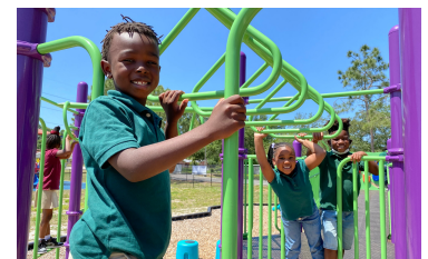
Lockart Elementary Magnet School $70k - K-3 Playground