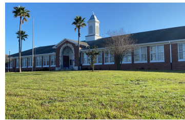
Kenly Elementary School $2 Million - Partial A/C Overhaul